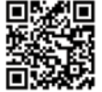
Optimum WiFi Hotspot Finder App

Check out our map of indoor and outdoor hotspots at optimum.net/wifi or use your iPhone®, iPad® or iPod touch® to track them down with the Optimum WiFi Hotspot Finder App. Download it from the Apple App Store or scan the code to the right.